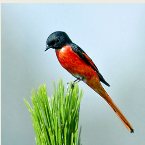
Long Tailed Minivet

Attire: The center is at a height of 2400 msl. All participants must remember to bring good walking shoes, light woolen clothes for summer and heavy woolens for the autumn. Scarves and caps are useful due to strong summer sun and winds. A torch will always be helpful while being in the outdoors at night. BD course and trainings always have practical's, so remember to bring working clothes which and get wet and muddy.