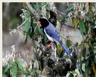
The Red-Billed Blue magpie