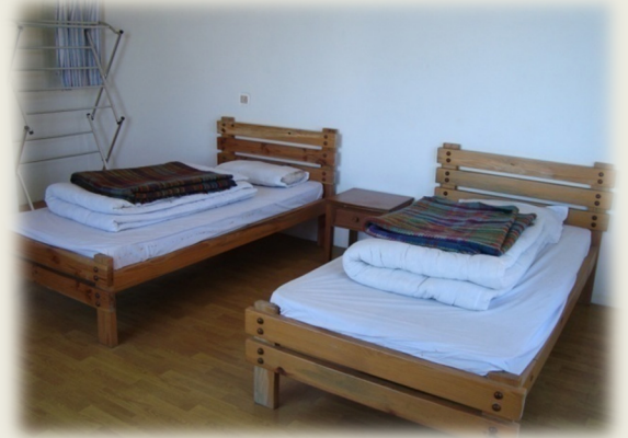
Resource Person's Room

in the ' Howard House ' in bunks sharing the toilets or other shared accommodation in Oak Hut & Bagdi House. There is a separate housing for the girls/ ladies and resource persons.