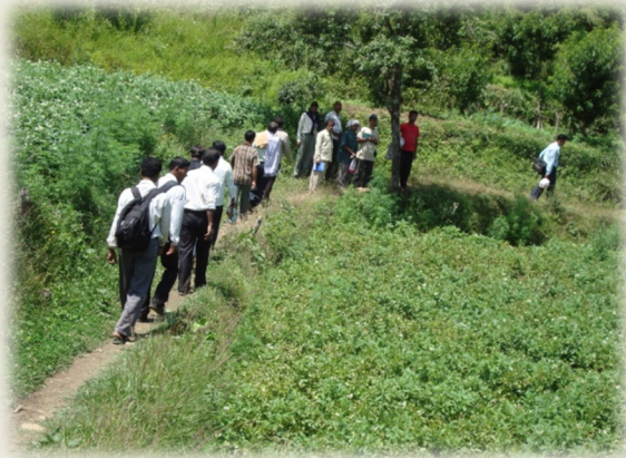
Walk in the BD Village

STC is surrounded by the SANSAKT project where 200 farmers are practicing BD / organic